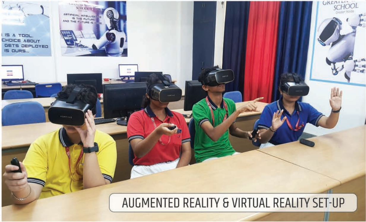
AUGMENTED REALITY & VIRTUAL REALITY SET-UP